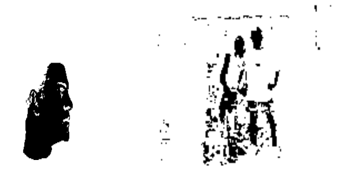
Fig (5) Adaptive Skin Color