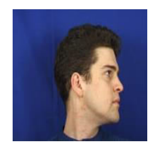
Fig (4) NonAdaptiveSkinColor