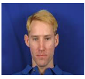
Fig (2).TSL Color Space